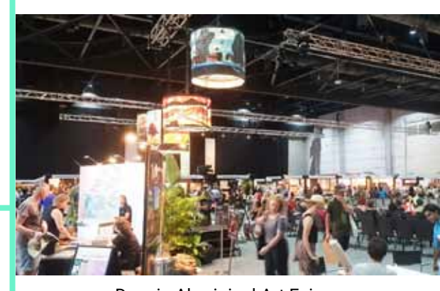
Darwin Aboriginal Art Fair 9-11 August 10 AM- 4 PM at Darwin Convention Centre FREE entry, open to the public