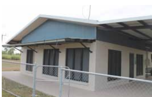
Renovated houses and new fences at Knuckey's Lagoon and PIV community