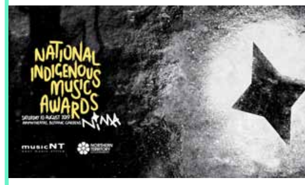
National Indigenous Music Awards (NIMA) 10 August 2019 | 6 PM at Darwin Garden Amphitheatre, Tickets: $40